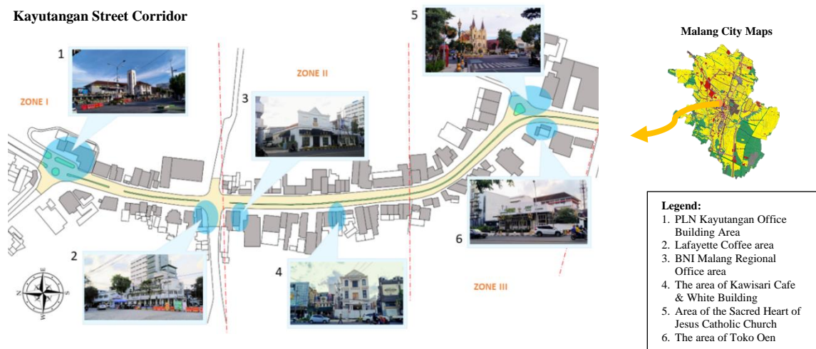
Fig. 1: Research Study Areas

Participatory photography is a method that asks participants to walk around and take photos of things that increase their positive impression so that they can effectively capture what they see and feel (Ernawati & Moore, 2014; Nugroho & Zhang, 2022). From the results of this study, six case study area locations spreading over the three corridor zones were chosen. Sequentially, these are PLN Kayutangan Office Building area, the Jam Kota Monument (Stadsklok), and its surroundings; the Lafayette Coffee & Eatery area, the police station, and its surroundings; the BNI Malang Regional Office, pedestrians, and surrounding areas; the Kawisari Cafe area, the White Building, and its surroundings; the area of the Sacred Heart of Jesus Catholic Church, the Chairil Anwar Monument, and its surroundings; and the Toko Oen, pedestrians, and surrounding areas.