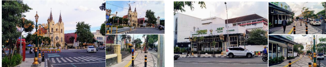
Fig. 4: Sacred Heart of Jesus Catholic Church Area and Toko Oen Area

visually for visitors and forms a more profound impression. Both of these areas have solid feeling qualities. Visitors already have a robust self-identification relationship with the place or identification of place identity and have a firm place attachment. However, place dependence scales still have a strong feeling quality, which means that their degree of dependence and incomparability of places still needs to be more significant.