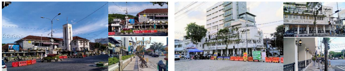
Fig. 2: PLN Kayutangan Office Building Area and Lafayette Coffee Area

The assessment of place attachment and place dependence dimension scales have the same feeling quality, but the first case study area has a lower value than the second. In terms of the function, buildings in this area are quite different, namely the function of offices and as cafés. Respondents are more motivated to visit the second case study area because of its function as a commercial, public building which allows them to stay at any time; therefore they depend on and feel attached to the place. Because the two buildings still preserve their original architectural style, the respondents feel proud and worried if the authenticity of these buildings will fade or will not be well-maintained.