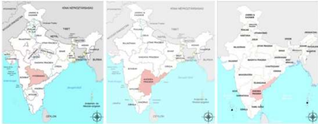
Fig. 1: Andhra Pradesh at Different Periods, 1951, 1956 & 2014. (not to scale)

Andhra was the first Indian state formed primarily on a linguistic basis. It was carved from the Madras Presidency in 1953. In 1956, the state was merged with the Telugu speaking portion of Hyderabad state to create the state of Andhra Pradesh. On June 2, 2014, the state of Andhra Pradesh was bifurcated under the section 26 of the Andhra Pradesh Reorganization Act, 2014 into two states, the state of Andhra Pradesh and Telangana as shown in Figure 1.