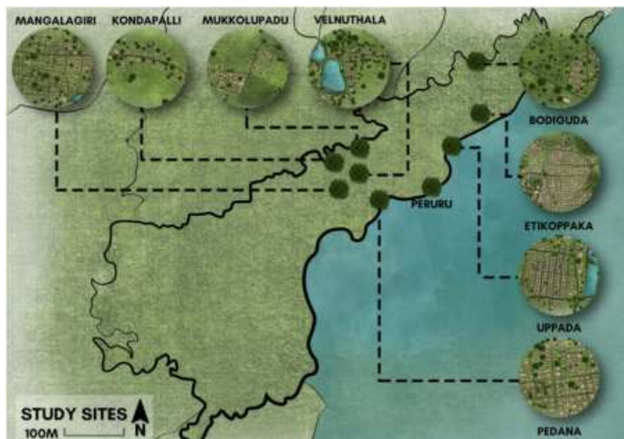
Fig. 2: Andhra Pradesh case study areas

The research chose nine areas based on the study objectives for the primary data collection. The selection of villages is from the districts where agriculture is practiced predominantly although the villages also have diverse occupational patterns.